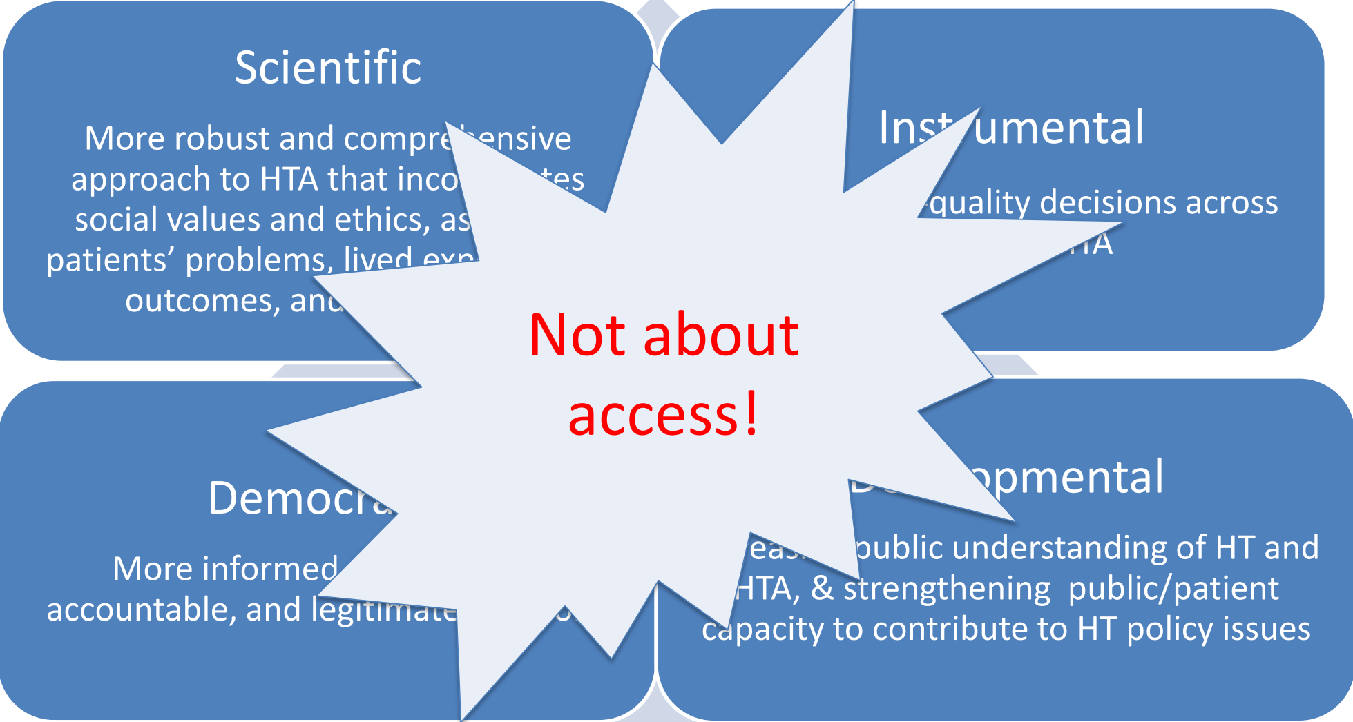
Theorized Goals of Public and Patient Involvement in HTA Final Report from the OHTAC Public Engagement Subcommittee. April 2015